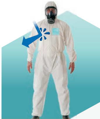
Micro Guard 2000 Suit