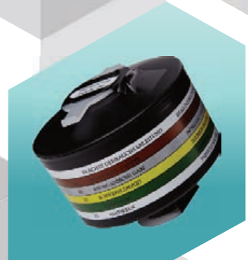
Type A2B2E2K1-P3 Universal Canister